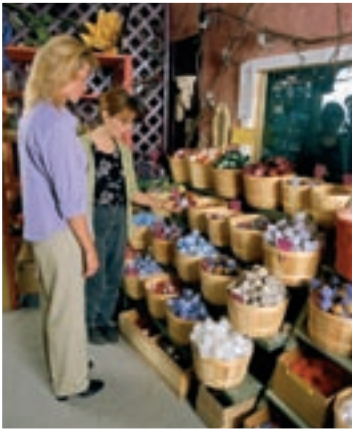
Kokimo Candleland, Castleton

Cross County Road 2 and proceed north along Stoney Point Road until you reach the stop sign. Turn left onto White's Road. Travel this roller coaster road until you reach County Road 26 at the stop sign. Turn right and proceed north along picturesque County Road 26. At the